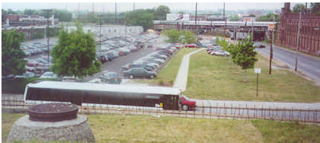
Existing conditions showing abandoned freeway in foreground, commuter parking and MARC train on bridge in background

ArchPlan worked as a consultant to Whitman, Requardt and Associates, LLP to improve the West Baltimore MARC station. ArchPlan reviewed the site conditions, the past planning materials and the West Baltimore MARC Quality Community Study documentation. ArchPlan developed short, mid and long-term scenarios and a feasibility analysis for improvements for an intermodal transit hub integrating MARC, possible future Light Rail and Bus.