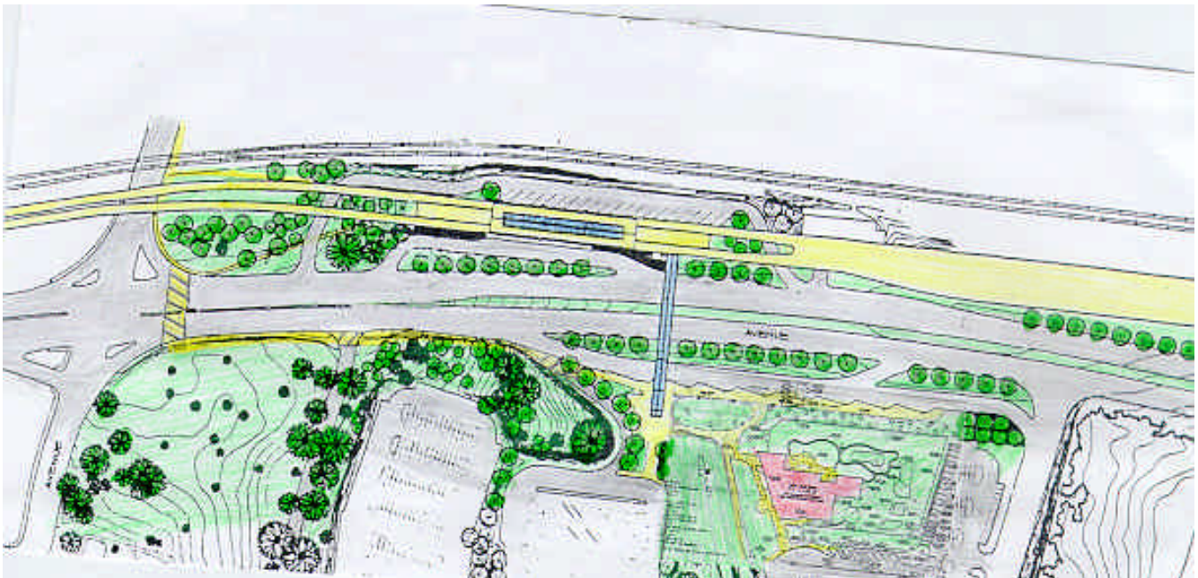
Overall site plan with improvements