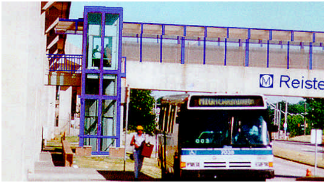
Accent station with MTA system color.